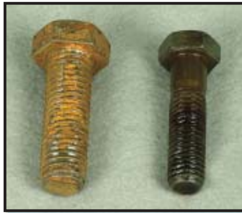
CONVERTS RUST TO BLACK FLUID